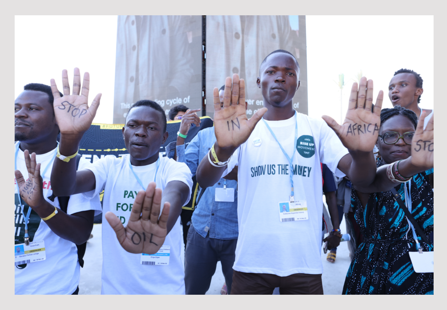
StopEACOP activists hold an action at COP27 in Sharm El-Sheikh and demand an end to oil in Africa.